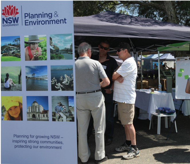
Community information stall

The Community Consultation Report on our website provides further details.